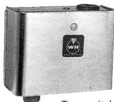
Two switch unit shown