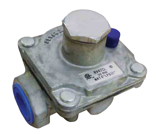
RV47CL-33 (1/2 PSIG Gas System)

Gas appliance regulators are designed for main burner and/or pilot applications, where precise control of tiny flows is an essential operating requirement. Housings are high strength aluminum castings and all models have been tested for multi-position and may be installed in any plane or angle without restriction. They may be used with natural, manufactured, mixed LP, or LP gas-air mixture.