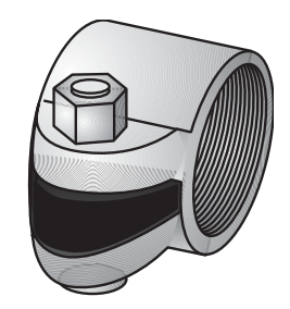
Type SSP-100 and SSP-125