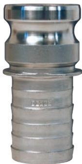
male adapter x notched hose shank