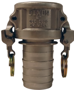
female coupler x notched hose shank