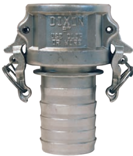
female coupler x notched hose shank