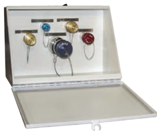
receivers sold separately