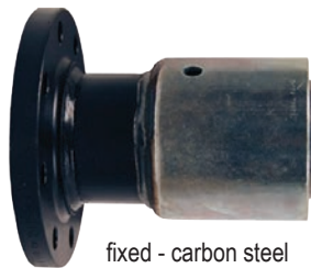
fixed - carbon steel