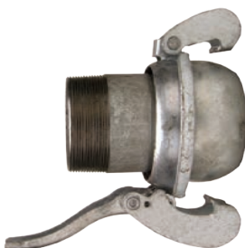
Type B male with male NPT