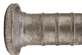
Type B female with hose shank with gasket

1 10" and 12" supplied with ACB304 lever assist bar