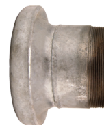
Type B female with male NPT with gasket