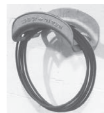
DHR2 double hose rack (hose not included)