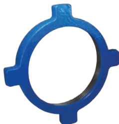
6" and 8"