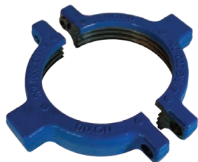
figure 200 / 206