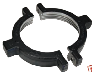
suction and discharge