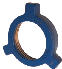
3" and 4"