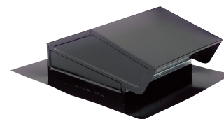
Roof & Wall Caps***