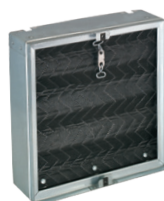
RDFU - Optional Radiation Damper Kit***