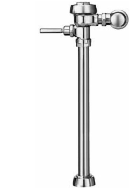
Model Royal 116 Shown