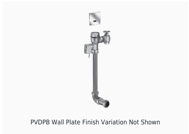
PVDPB Wall Plate Finish Variation Not Shown