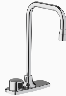
Variations not shown: Above Deck Mixer with 8" Trim Plate