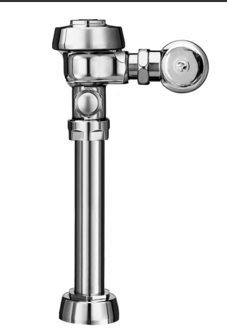
Model Royal 111-1.6 HKL Shown

Consult factory for matching Sloan brand fixture options.