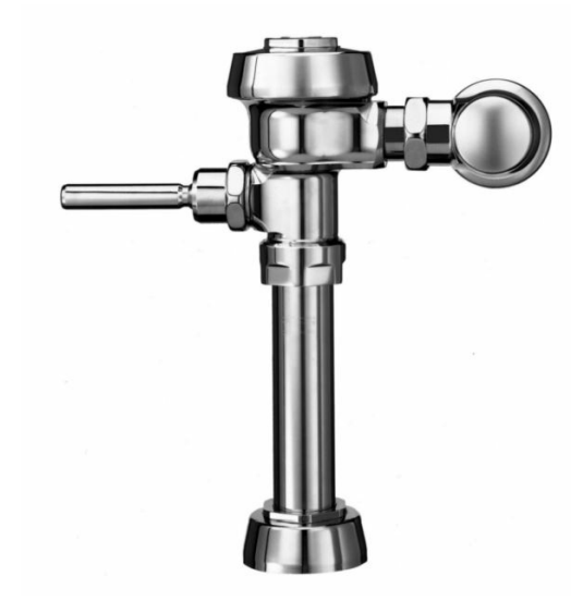
*Model 111 Shown*