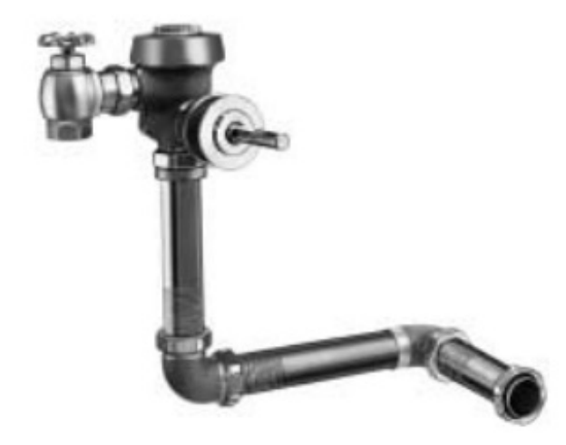
Model Royal 144 Shown

See Accessories Section of the Sloan catalog for available accessories