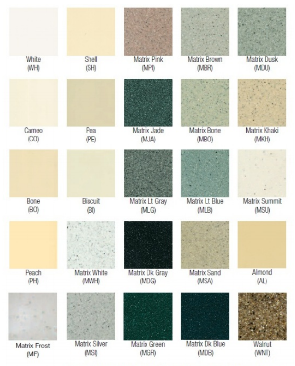
For in stock availability and quick-ship options please contact your local Sloan representative.