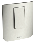
Brushed Nickel (BN)