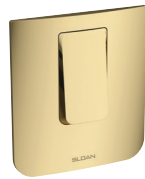
Polished Brass (PB)