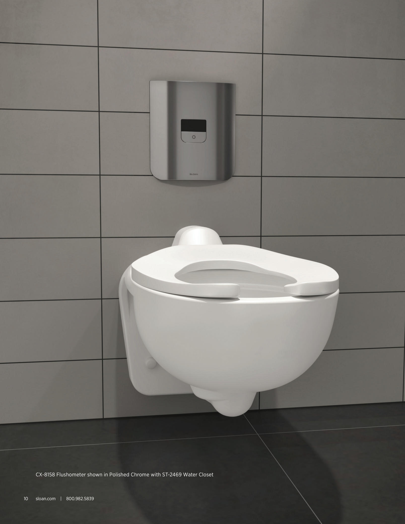
CX-8158 Flushometer shown in Polished Chrome with ST-2469 Water Closet