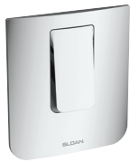
Polished Chrome (CP)