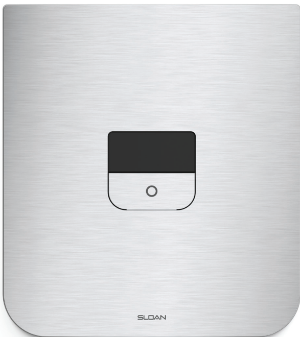
Brushed Stainless (PVDSF)