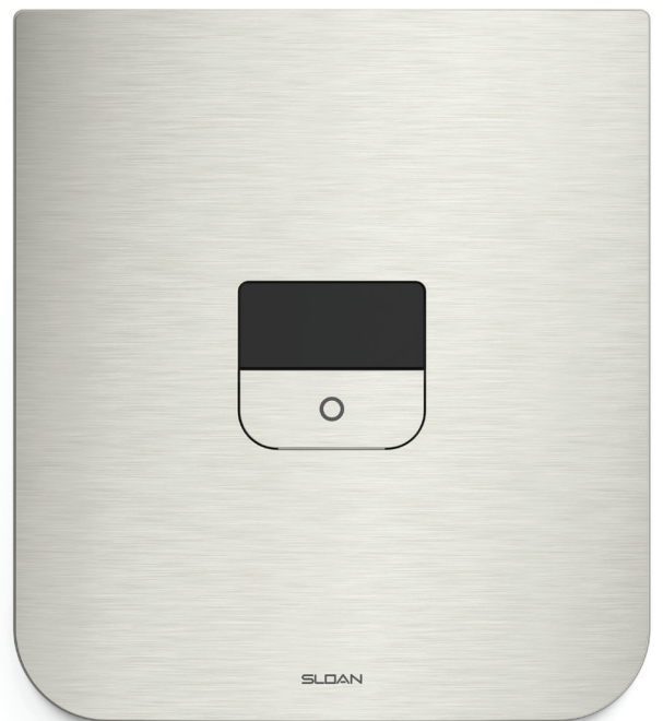
Brushed Nickel (PVDBN)