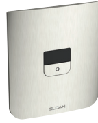
Brushed Nickel (BN)