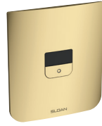
Polished Brass (PB)