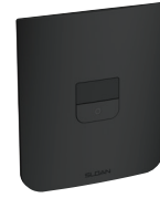
Matte Black (MB)