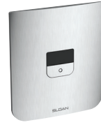
Brushed Stainless (SF)