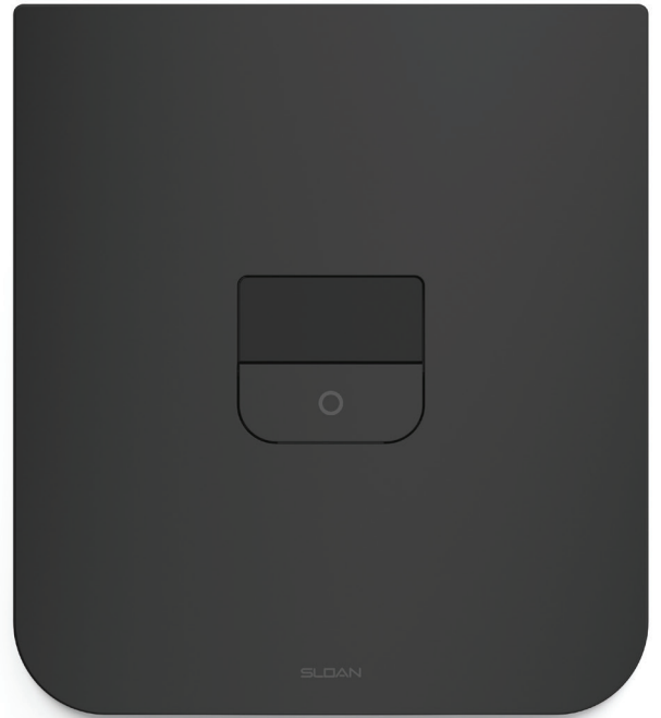
Matte Black (PVDMB)