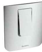
Brushed Stainless (SF)