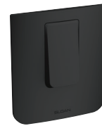
Matte Black (MB)