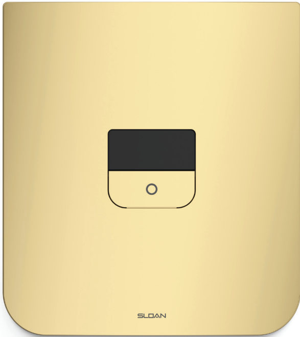
Polished Brass (PVDPB)