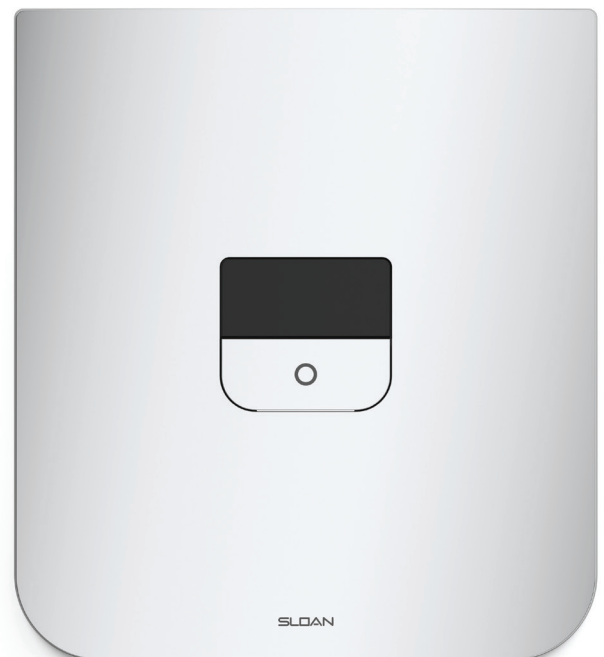
Sensor-Activated in Polished Chrome (CP)