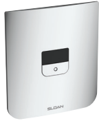
Polished Chrome (CP)