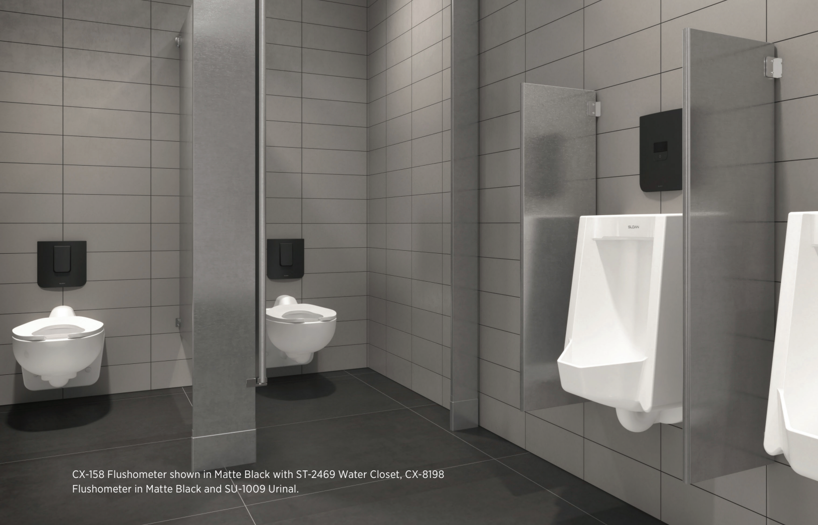
CX-158 Flushometer shown in Matte Black with ST-2469 Water Closet, CX-8198 Flushometer in Matte Black and SU-1009 Urinal.