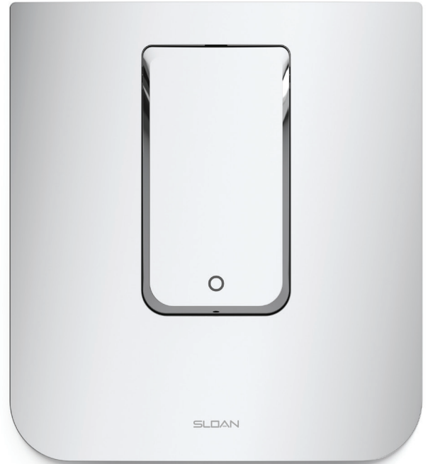
Manual in Polished Chrome (CP)

We've worked closely with architects and designers around the world to ensure that our efficient, water-saving products are also beautiful. With a choice of Polished Chrome or 4 attractive PVD finishes, including our newest color, Matte Black, the CX allows you to make the statement of your choice that elevates your restrooms.