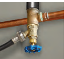
▲ Force pump drain line injection