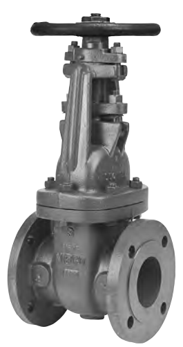
F-637-33 Flanged-Raised Face