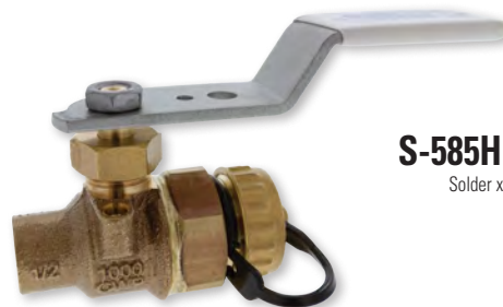
S-585HP-LF-HC Solder x Hose Cap

S-585HP-66-LF-HC with stainless steel trim also available.