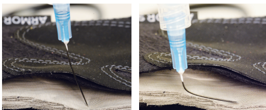
25 gauge needle buckling