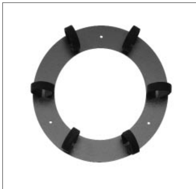
Recloseable Storage Rings

See ELECTRONIC FILES for CAD files (.DXF, .DWG, MS-DOS.EPS) on disk