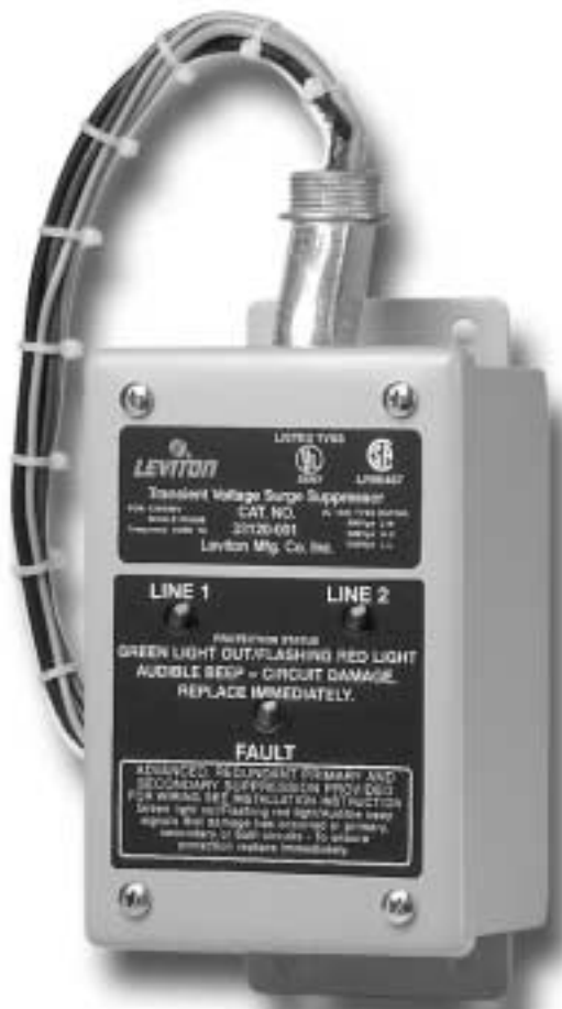
Cat. No. 32120-001

Cat. No. 32000 is designed for use where a multi-phase, transient voltage surge suppressor (TVSS) is specified. Its parallel-operated design features 40mm-diameter, metal-oxide varistors and EMI/RFI filter circuitry equipped with high-voltage-rise capacitors for harmonic tolerance. It incorporates indicator lights and an audible alarm for monitoring power and surge suppression status as well as a dry contact for remote monitoring. Three-phase units are suitable for both WYE and DELTA alternating current systems. Only Cat. No. 32120-001 is a single-phase surge suppressor. The 32000 has been tested to ANSI/IEEE C62.41 standards for Category A, B and C environments and is UL 1449 (2nd Edition) Listed. It is also backed by Leviton's Limited Ten-Year Warranty.