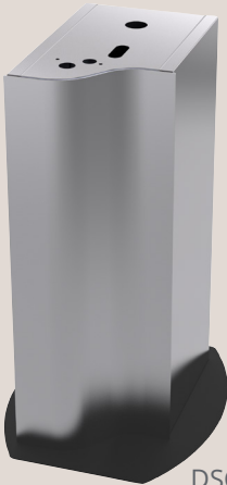
DSCABWH For use with DSWH160UVPC. (See front cover image of unit on cabinet.)