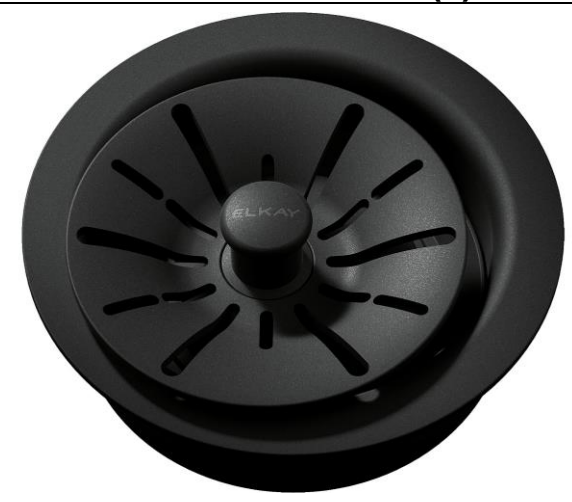
AMERICAN PRIDE. A LIFETIME TRADITION. Like your family, the Elkay family has values and traditions that endure. For almost a century, Elkay has been a family-owned and operated company, providing thousands of jobs that support our families and communities.