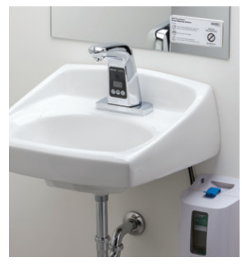
The EFS includes a small placard placed near the system that provides simple instructions and acts as a second visual cue for staff and visitors.

The EFS delivers a repeatable, consistent hand-washing procedure that supports efforts for improved hand hygiene in hospitals and other healthcare environments. The simple 3-step process, including a timed soap-scrubbing period, supports the CDC hand-washing recommendations to help reduce hospital acquired infections.