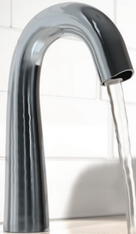
EQ Series High Arc Spout