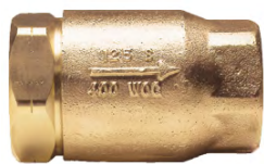
61LF-100 FEMALE x FEMALE THREADED 1/4" THROUGH 3"