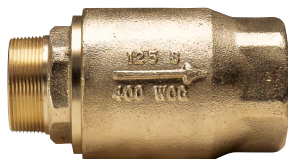
61LF-200 MALE x FEMALE THREADED 1/4" THROUGH 2"