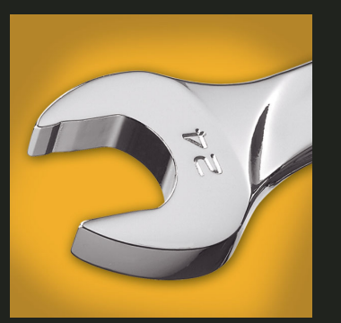
Surface Drive Plus<sup>™</sup> provide a stronger grip on fasteners and delivers up to 25% more torque.