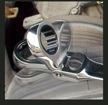
Flexible head has thirteen locking positions and is up to 15% longer.