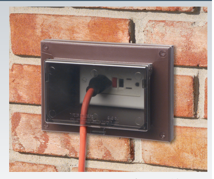
Weatherproof-in-use. DSHB1BRC shown. IN BOX Saves Time. Looks Great!