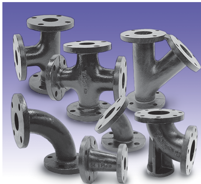
Cast Iron Flanged Fittings and Cast Iron Flanges

An inspection limit of plus or minus 1/32 inch (1mm) shall be allowed on all center to contact surface dimensions for sizes up to and including 10 NPS (250 DN); plus or minus 1/16 inch (1.5mm) on sizes larger than 10 NPS (250 DN). Inspection limit of plus or minus 1/16 inch (1.5mm) shall be allowed on all contact surface to contact surface dimensions for sizes up to and including 10 NPS (250 DN); plus or minus 1/8 inch (3mm) on sizes larger than 10 NPS (250 DN). The largest opening in the fitting governs the tolerance to be applied to all openings.