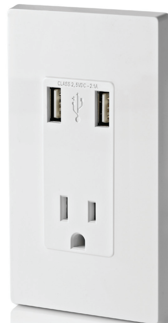
Cat. No. T5630 Shown with screwless wallplate 80301 sold separately