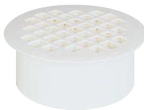
Inside Pipe Drain One-piece PVC