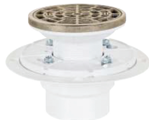
Shower Pan drains Nickel-bronze Ring & Strainer