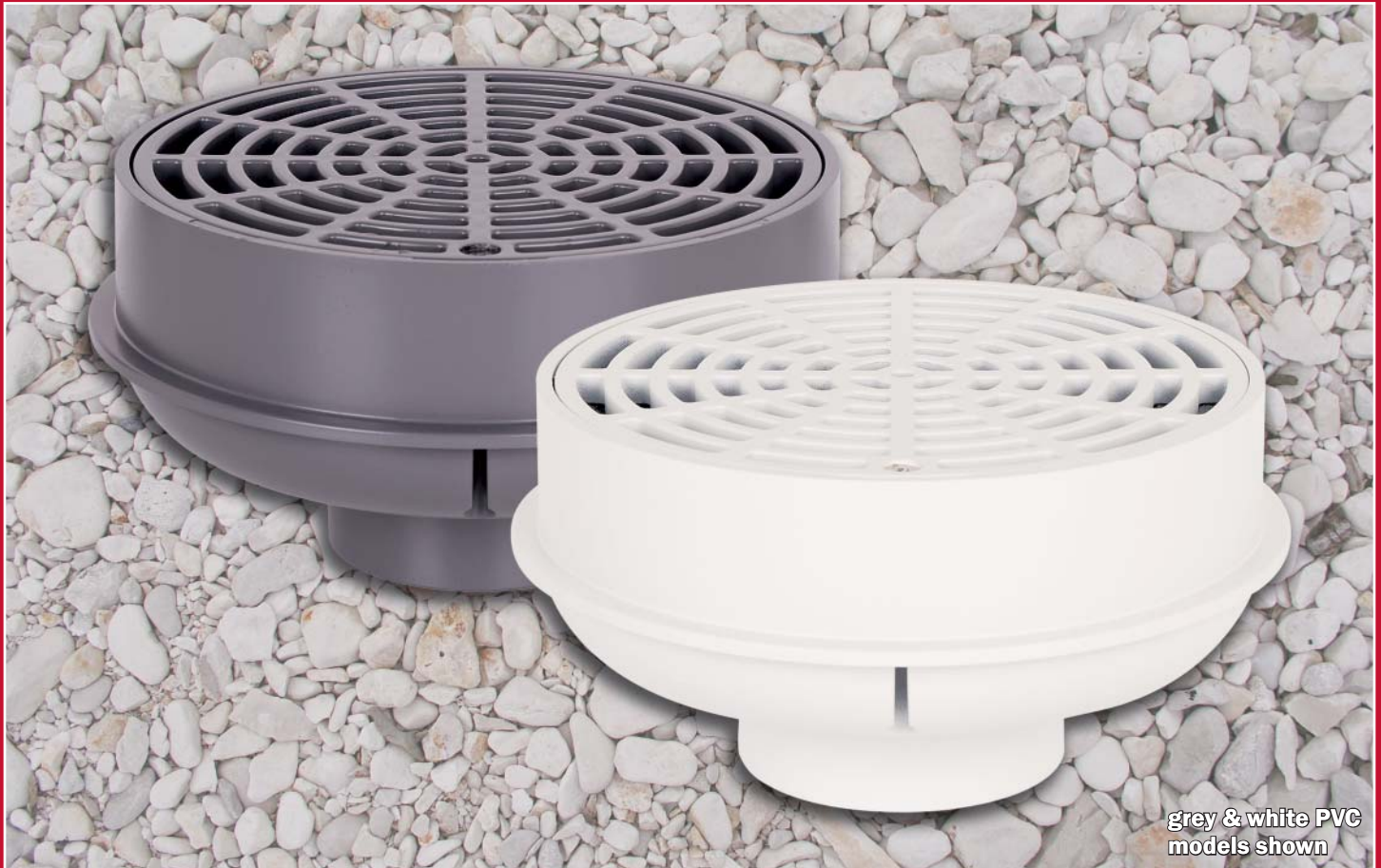
grey & white PVC models shown