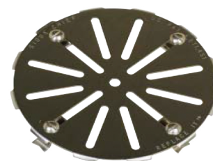
Replace-It™ Adjustable Replacement Strainer