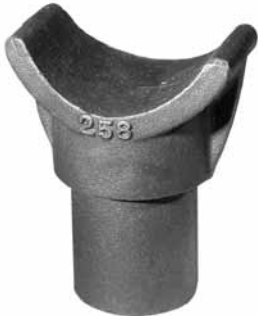
Fig. 258 Cast