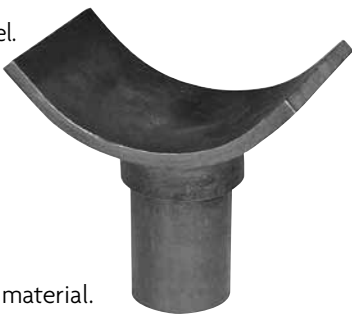
Fig. 258 Fabricated Steel

Size Range: 4" through 36" Material: Sizes 4" through 12" are Cast Iron. Sizes 14" through 36" are Carbon Steel. Sizes 4" through 12" are available in Carbon Steel by special request only. Finish: Plain or Galvanized Service: Stanchion type support for stationary pipe. Approvals: Complies with Federal Specification A-A-1192A (Type 36), WW-H-171-E (Type 36 & 37), ANSI/MSS SP-69 and MSS SP-58 (Type 36). Installation: Slip saddle base into riser pipe. Ordering: Specify size to be supported, figure number, name, finish and material. Order Separately: Figure 63P Square Cut End Stanchion. Specify "H" and pipe size to be supported by Figure 258.