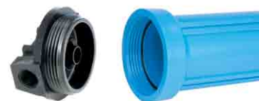
Heavy-duty construction — Housings are made entirely of the highest quality FDA grade polypropylene