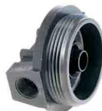
Buttress thread design — Provides greater security