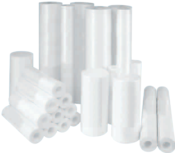
Melt Blown Filter Cartridges