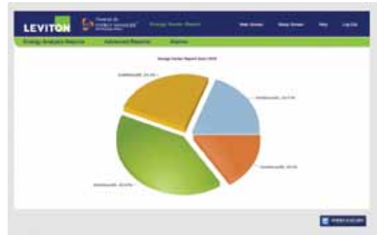
Energy Center Report