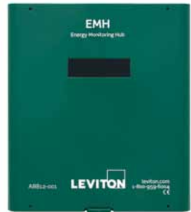
Energy Monitoring Hub