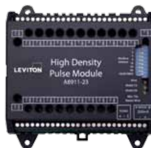
High Density Pulse Module