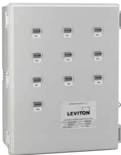
Mini Meter Multiple Meter Unit (MMU)