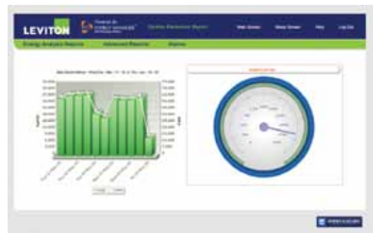
Carbon Emissions Report