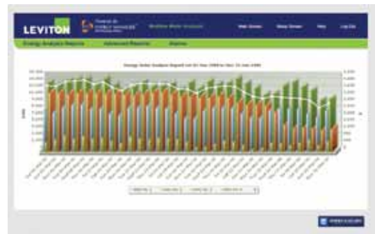
Multiple Meter Analysis Report