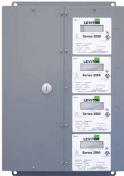
Series 2000 Multiple Meter Unit (MMU)

All Leviton MMUs are UL Listed assemblies, giving your customers extra assurance for no extra cost. Choose from an indoor steel model in 4/8/16 unit single- or three-phase configurations utilizing Series 2000 meters or a weatherproof outdoor enclosure in 4/8/19 unit single-phase configurations utilizing Mini Meters. If your application requires a different configuration, Leviton is ready to help.