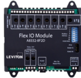
Flex I/O Module