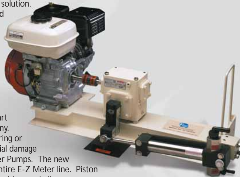
CDS-John Blue E-Z Meter Available Models and Power Sources