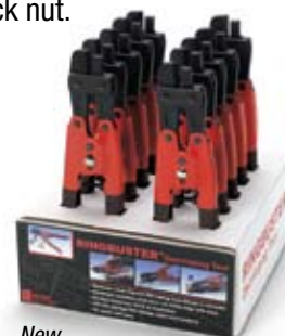
New point-of-purchase display