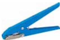
Cable Tie Tensioner