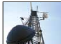
Telecommunications & Utility