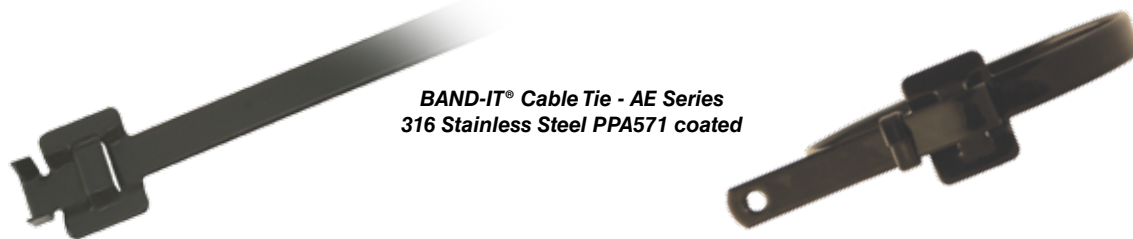
BAND-IT® Cable Tie - AE Series 316 Stainless Steel PPA571 coated

The AA's Nylon 11 coating has very good chemical and weathering resistance, long-life expectancy, and is halogen free and non toxic when exposed to flame.