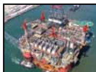
Offshore Oil Rigs