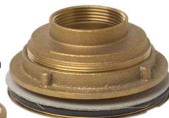
2" NPT Connection