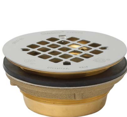
1 1/2" NPT Connection

TECHNICAL SPECIFICATION: Oatey Brass Shower Drains are designed for use with preformed shower stall bases. The drain body is sealed to the shower base with a rubber gasket and fiber slip washer. Three DWV connection methods provide a drain for all applications of metallic pipe. Drain top accommodates 4- \frac{1}{4} " Universal Snap-Tite Strainers available in a variety of designer finishes.