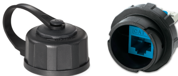
Pictured: DuraPort Industrial Connector Housing, CAT 6, w/ connector cap