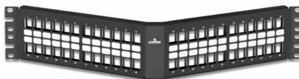
Pictured: 48-port panel