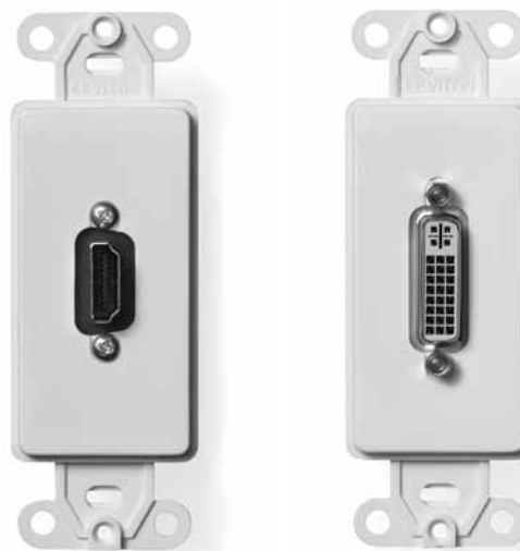
Pictured: HDMI 41647-00x (left), DVI-I 41648-00x (right)

For CAD files, Typical Specs, or Dimensional Line Art (.DXF, .DWG, MS-DOS.eps or .TXT), visit www.leviton.com .