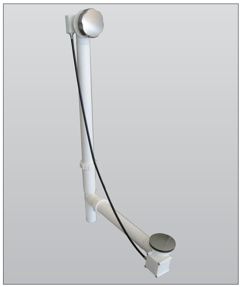
ABD100#CP - Cable Drain