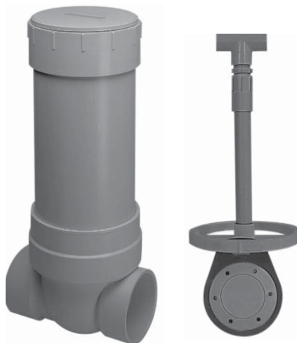
Valve with Extension Kit

Backwater Valves are designed to prevent backflow in numerous applications where easy service access for maintenance and cleaning is needed. Excellent for use in sanitary or storm sewer drainage systems to prevent waste back up due to inadequate drainage, for balancing multi-level ponds, aquaculture features or storage tank systems, and many other applications. Spears® Backwater Valve has been engineered for improved function and easier service, especially in buried service with use of optional Service-Access Extension Kit.